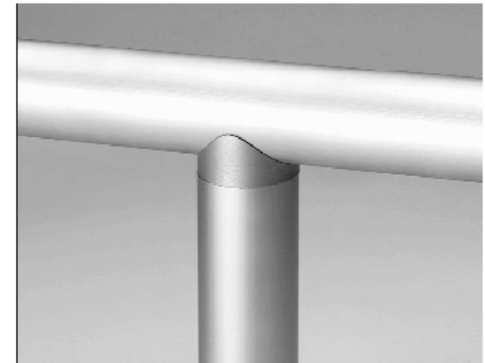
# 155 Tee